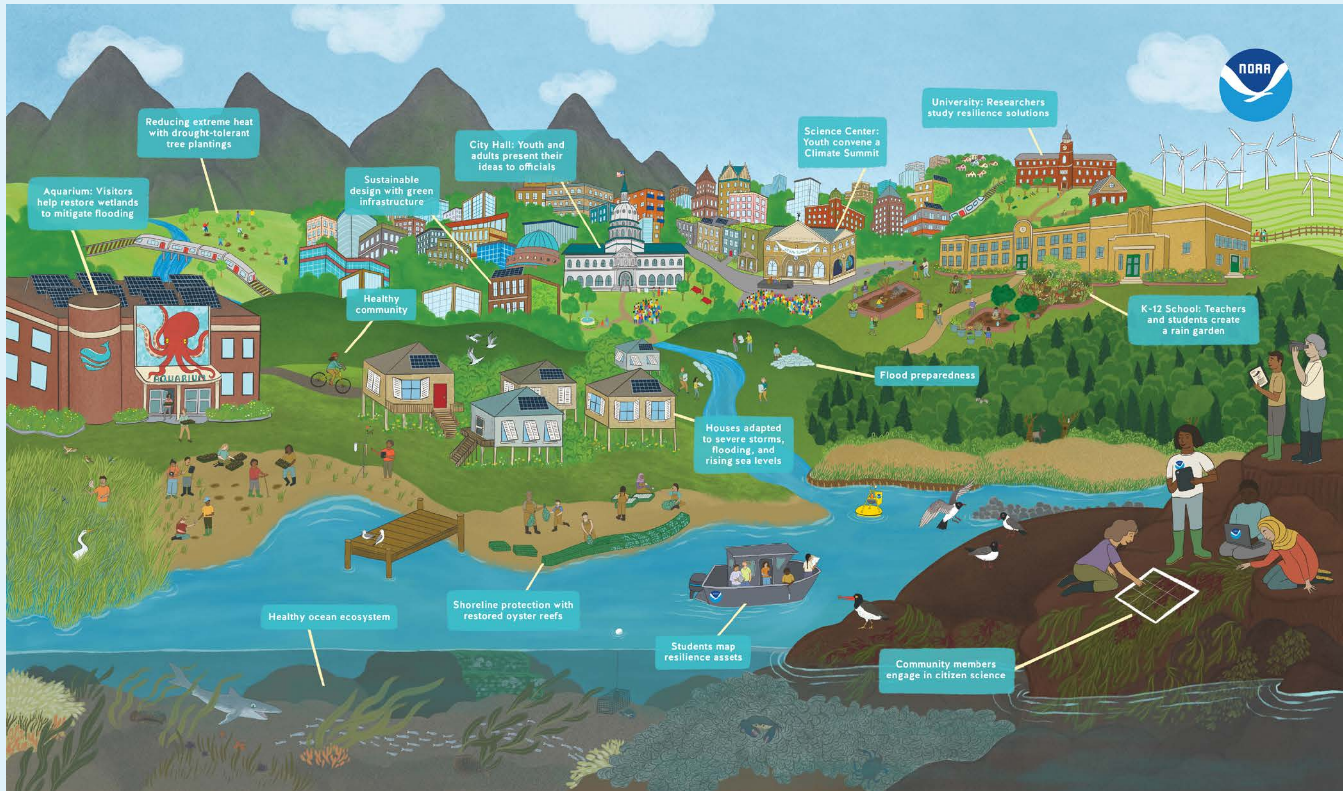
Figure 1: This illustration of the ELP Vision of a Resilient Community depicts several key aspects of the ELP Community Resilience Education Theory of Change. The ELP and end goals are brought to life through this portrayal of the future. The illustration also depicts all of the major institutional players, such as museums, aquariums, K–12 schools, universities and other educational and community-based organizations; the audiences; and the key approaches that have been identified as effective in using education to build community resilience. Children, youth, and adults are learning together and are directly engaged in activities that improve the resilience of their community.