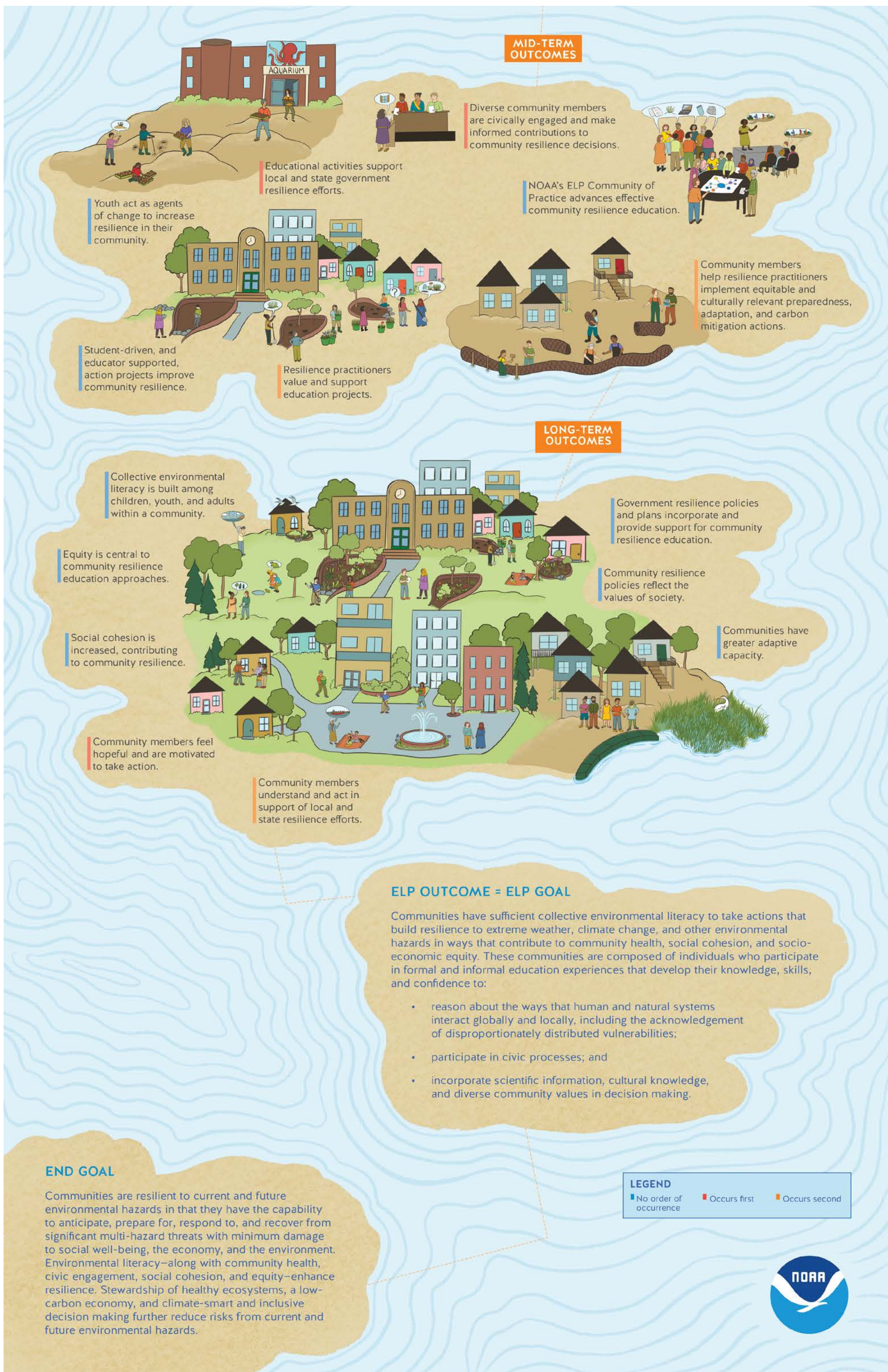
Figure 2b: Pathway to Change, continued