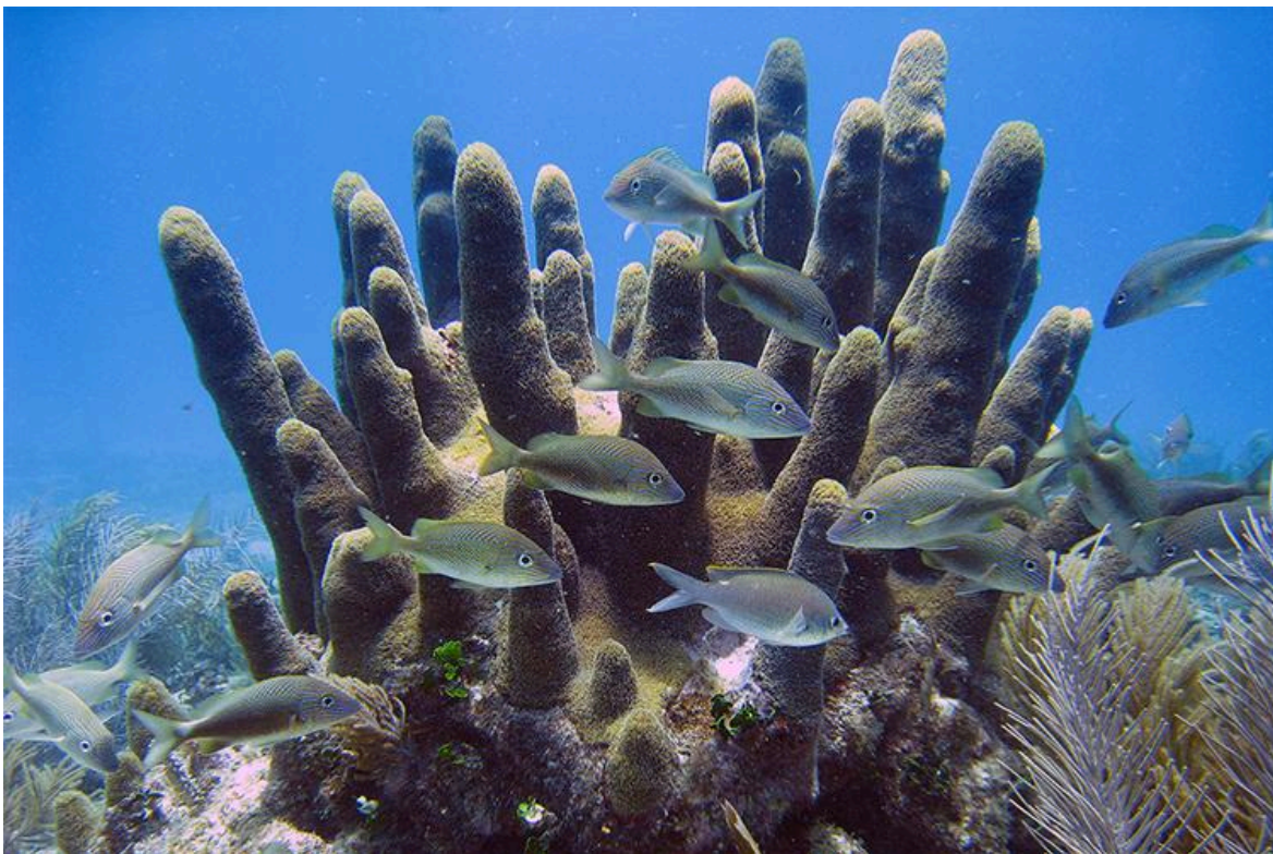
Pillar coral with fish.

Summary: NOAA Fisheries, designated critical habitat for five threatened Caribbean coral species, Orbicella annularis , O. faveolata , O. franksi , Dendrogyra cylindrus , and Mycetophyllia ferox , pursuant to section 4 of the Endangered Species Act (ESA). Twenty-eight mostly overlapping specific occupied areas containing physical features essential to the conservation of these coral species are designated as critical habitat. These areas contain approximately 16,830 square kilometers (km 2 ; 6,500 square miles (mi 2 )) of marine habitat. We have considered economic, national security, and other relevant impacts of designating these areas