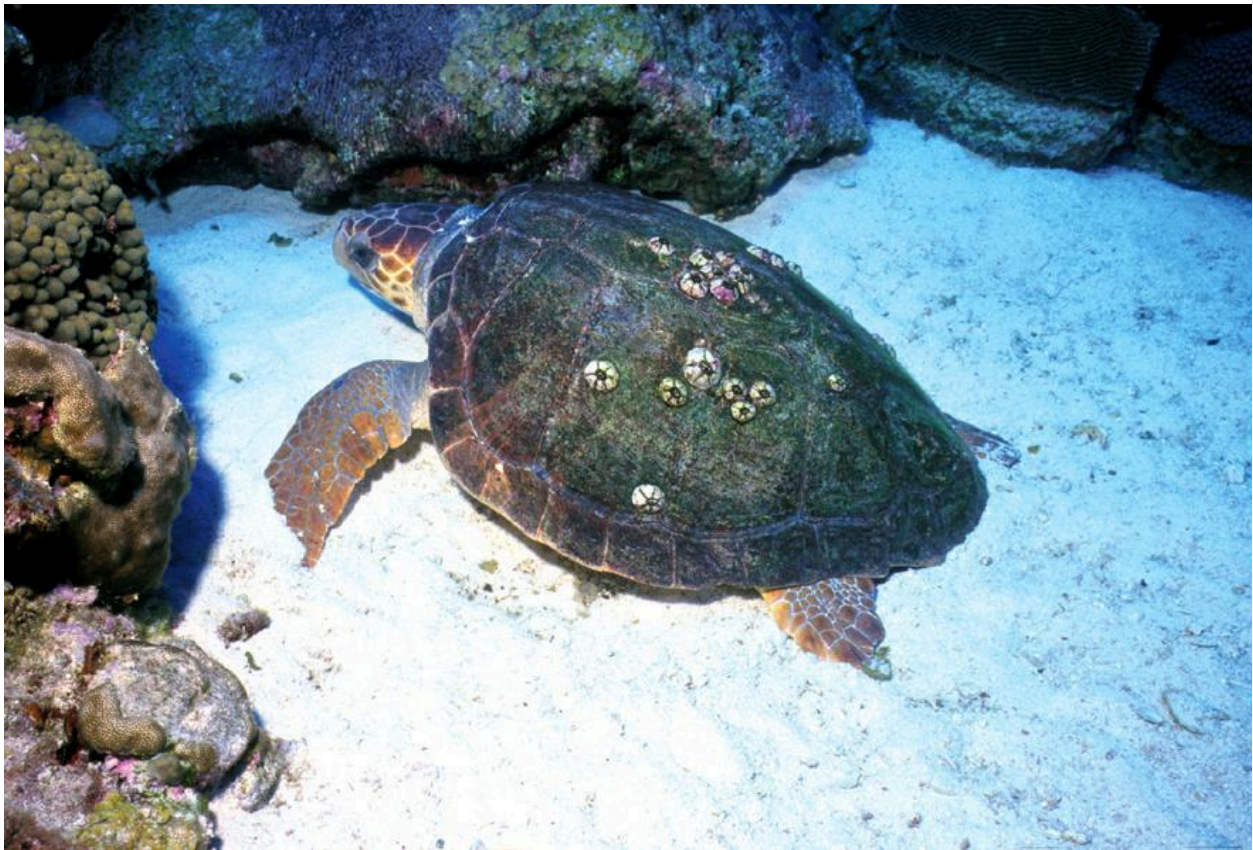
An immature loggerhead sea turtle.

As we celebrate the 50th anniversary of the Endangered Species Act, we are shining a spotlight on our recovery efforts to reduce bycatch to protect and conserve sea turtles.