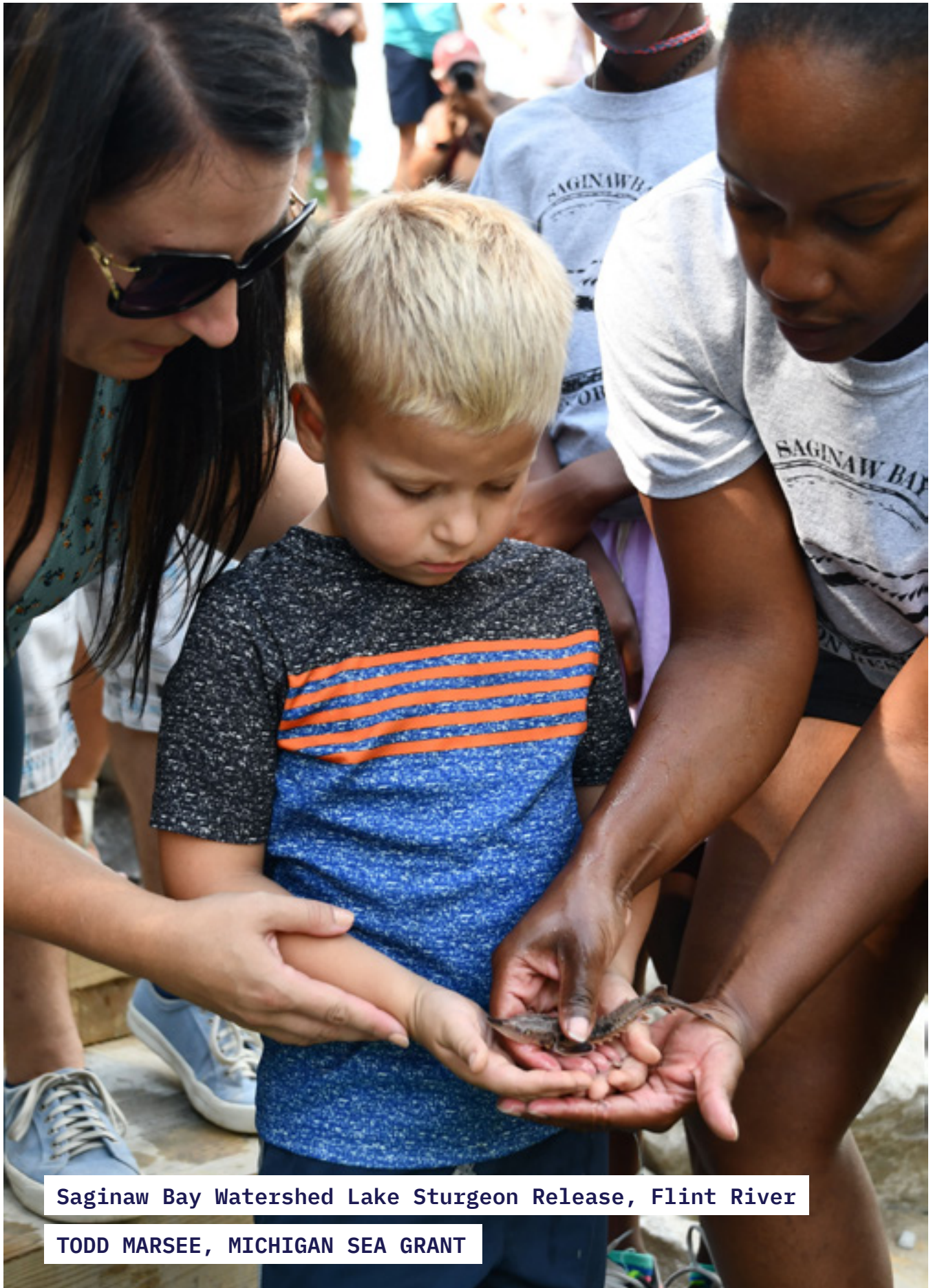
Saginaw Bay Watershed Lake Sturgeon Release, Flint River