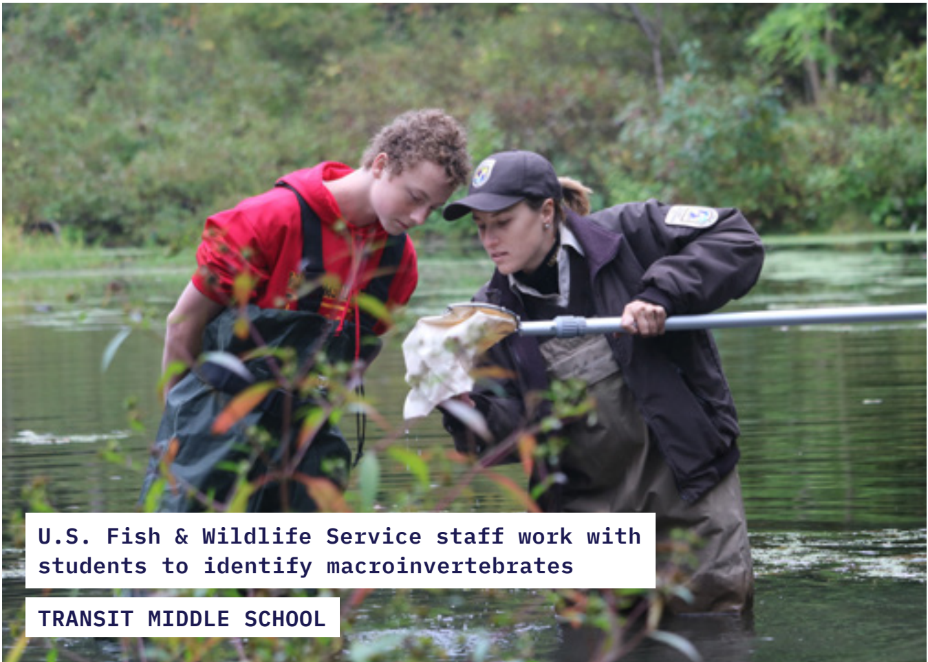
U.S. Fish & Wildlife Service staff work with students to identify macroinvertebrates