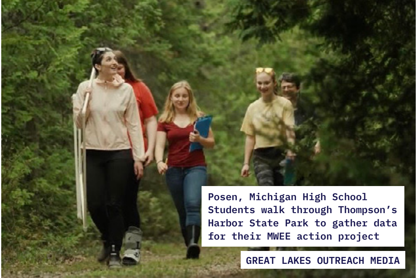
Posen, Michigan High School Students walk through Thompson's Harbor State Park to gather data for their MWEE action project