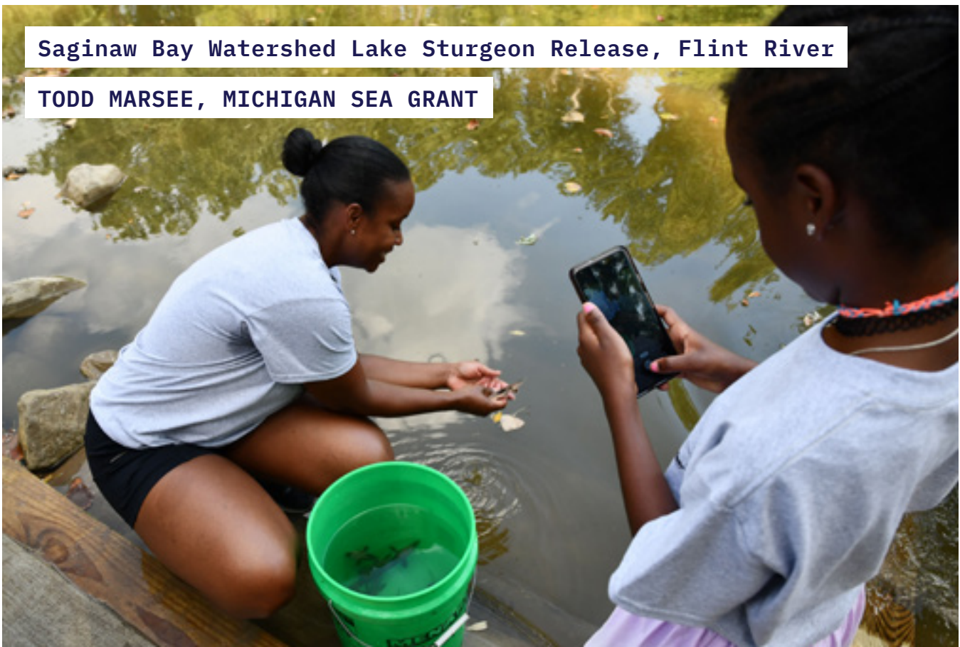
Saginaw Bay Watershed Lake Sturgeon Release, Flint River